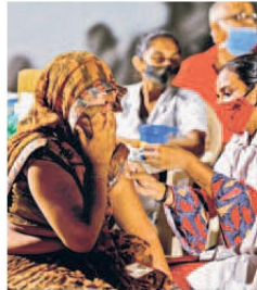
Sectors that saw most upgrades included pharma.

Icra upgraded ratings of 142 entities and downgraded 82 entities in April-June. "On the reasoning for upgrades in Q1 FY22, a longer track record of operations is seen to be the trigger in a large number of cases (particularly in power and roads sectors). The second has been a rising scale of operations and order book (chemicals, pharma, construction). The