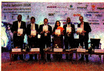
Release of Newsletter

deployment of Satellite communications technologies. The conference also reflected on drivers for Next Generation Satcom applications and services and satellite broadcasting in a converged