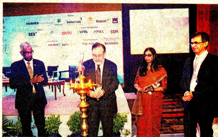
Lighting the Lamp

Broadband India Forum (BIF) has been working for the cause of proliferation of broadband and sees immense potential in the use of satellite as a medium for broadband and for acceleration of the government's Digital India program. One of its Core beliefs is that India needs to tap the true potential of satellite communications, not just by gainfully exploiting the spare satellite capacities over the visible Indian arc