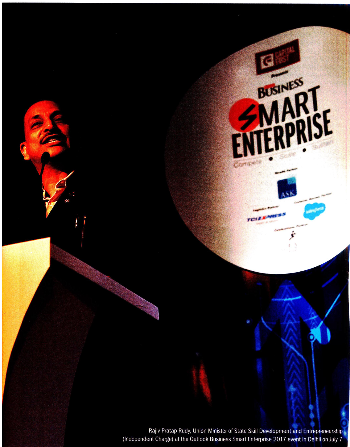
Rajiv Pratap Rudy, Union Minister of State Skill Development and Entrepreneurship (Independent Charge) at the Outlook Business Smart Enterprise 2017 event in Delhi on July 7